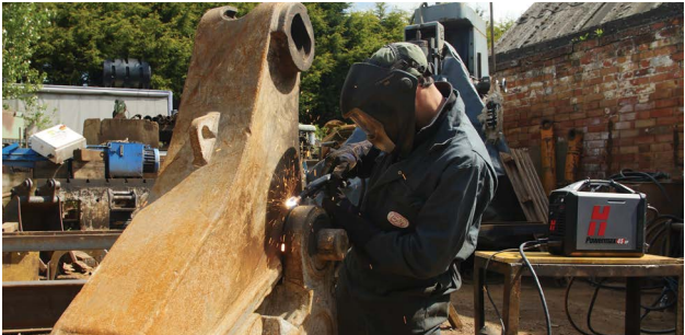
Maintenance and repair